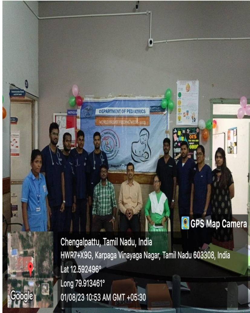
Group photo-Department of pediatrics and Organizers

G.S.T. ROAD, CHINNA KOLAMBAKKAM, MADHURANTHAGAM (TK), TAMIL NADU – 603 308 Ph.No. 044 7156 5100 – 299; E-mail: principal@kims.edu.in; Website: www.kims.edu.in