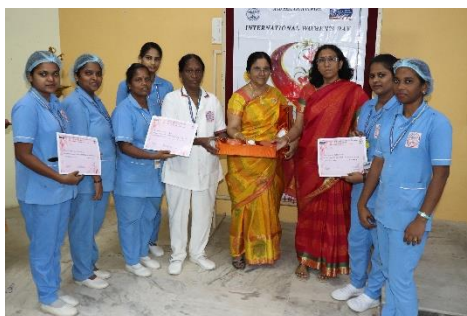
PRIZE DISTRIBUTION FOR RONGOLI COMPETITION

G.S.T. ROAD, CHINNA KOLAMBAKKAM, MADHURANTHAGAM (TK), TAMIL NADU – 603 308 Ph.No. 044 7156 5100 – 299; E-mail: principal@kims.edu.in; Website: www.kims.edu.in