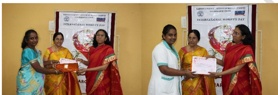
PRIZE DISTRIBUTION FOR COOKING COMPETITION