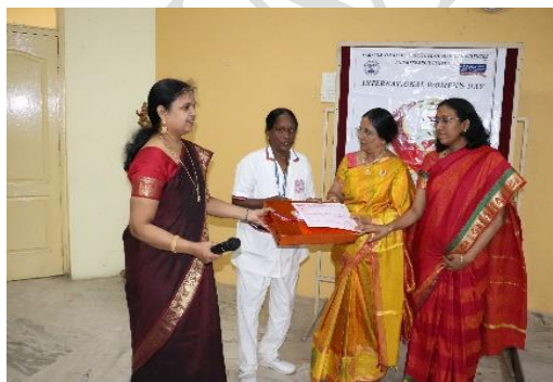
PRIZE DISTRIBUTION FOR THE TALK SHOW