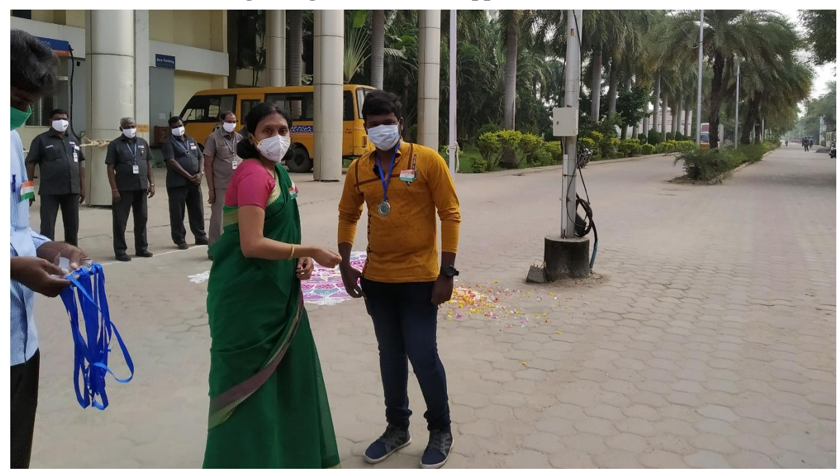
Page 3 of 7