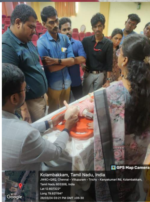
Hands on- pediatric resuccitation