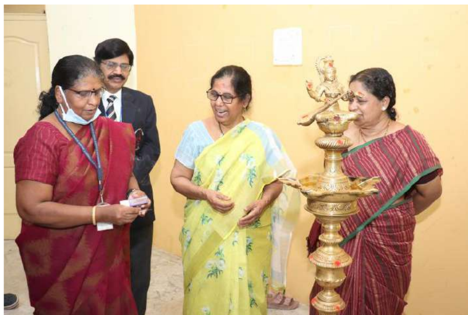
Lamp lighting by guest speakers