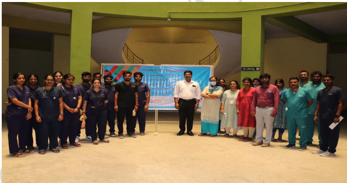
Group Photo (Organizers, CRRI, Staff) with Chief Guest