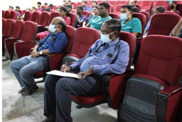
Audience listening to the speakers

G.S.T. ROAD, CHINNA KOLAMBAKKAM, MADHURANTHAGAM (TK), TAMIL NADU – 603 308 Ph. No. 044 7156 5100 – 299; E-mail: principal@kims.edu.in ; Website: www.kims.edu.in