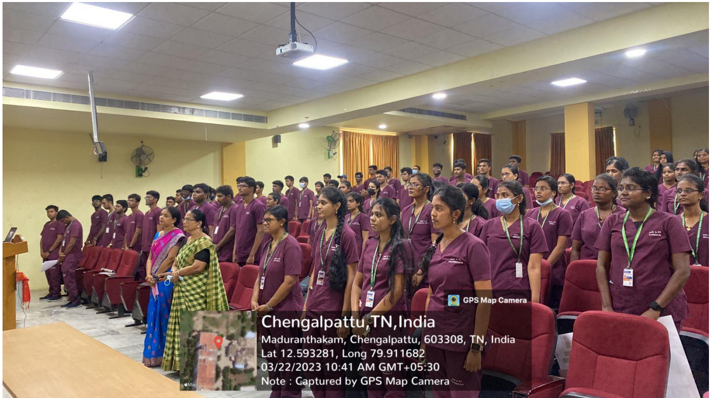
Figure 1 PROGRAM STARTED WITH TAMIZH THAAI VAALTHU

.T. ROAD, CHINNA KOLAMBAKKAM, MADHURANTHAGAM (TK), TAMIL NADU – 603 308 Ph.No. 044 7156 5100 – 299; E-mail: principal@kims.edu.in ; Website: www.kims.edu.in