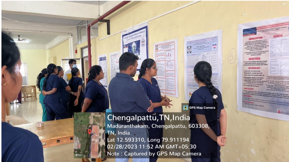
Postgraduates presenting the Posters to Judges

G.S.T. ROAD, CHINNA KOLAMBAKKAM, MADHURANTHAGAM (TK), TAMIL NADU – 603 308 Ph.No. 044 7156 5100 – 299; E-mail: principal@kims.edu.in; Website: www.kims.edu.in