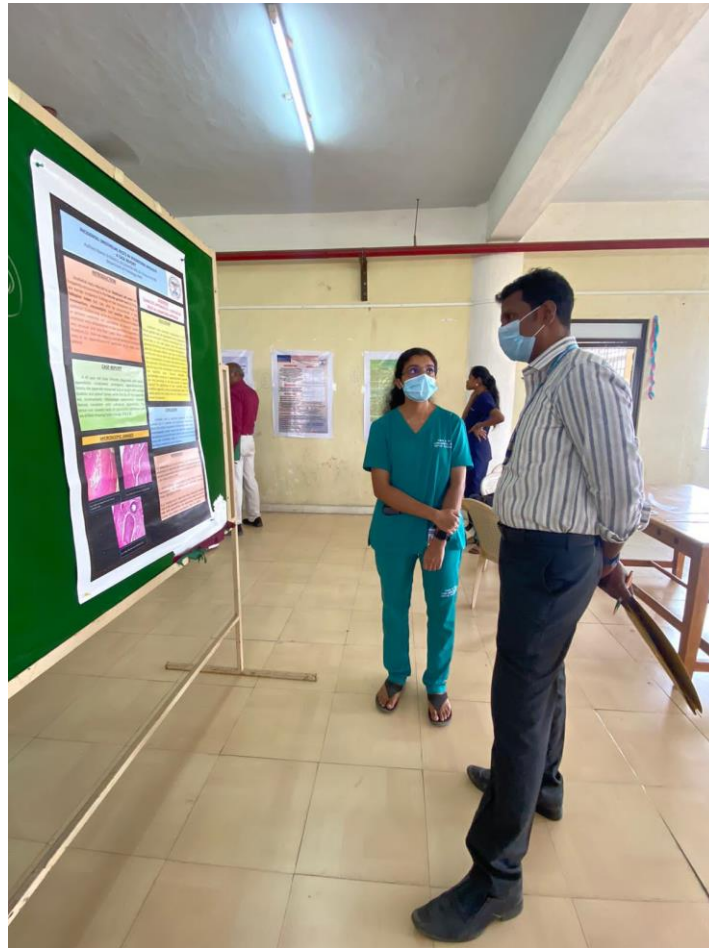
First Year MBBS students presenting posters to the Judges

G.S.T. ROAD, CHINNA KOLAMBAKKAM, MADHURANTHAGAM (TK), TAMIL NADU – 603 308 Ph.No. 044 7156 5100 – 299; E-mail: principal@kims.edu.in ; Website: www.kims.edu.in