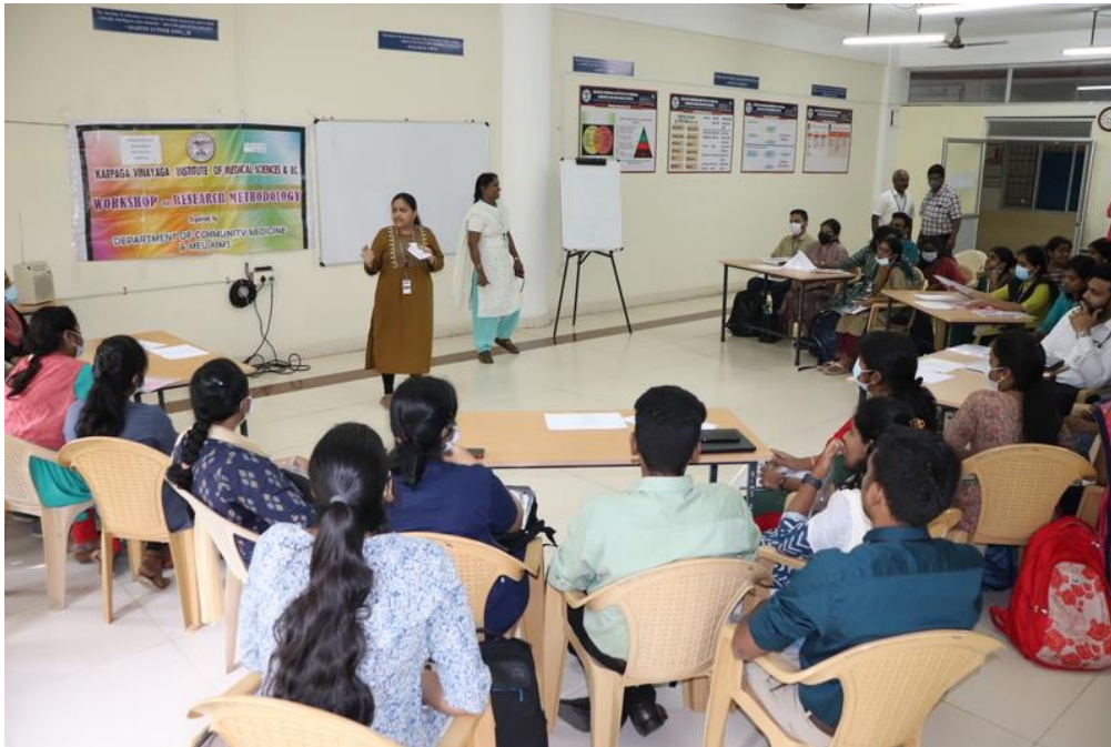
Group activity improving analytic skills