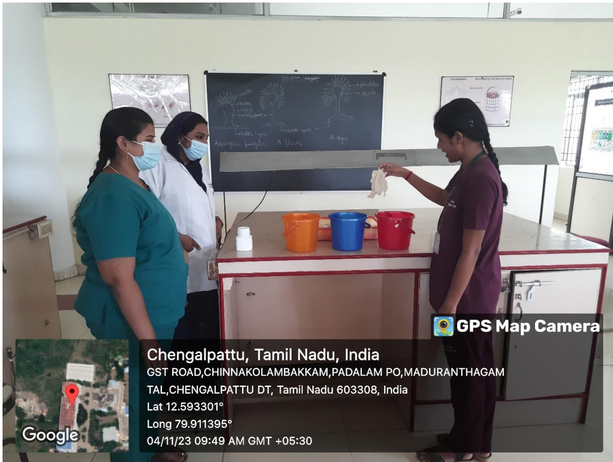
Skill certification assessment on biomedical waste disposal