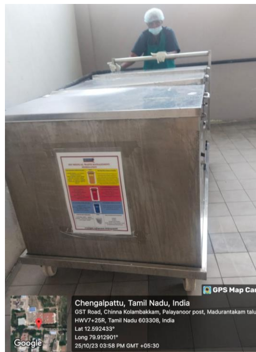
Then it is taken to central place for transport