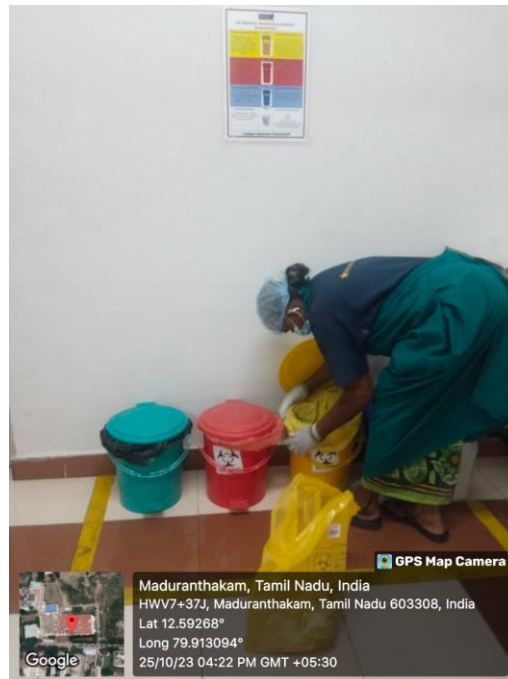
Waste is collected in a bag by biomedical worker