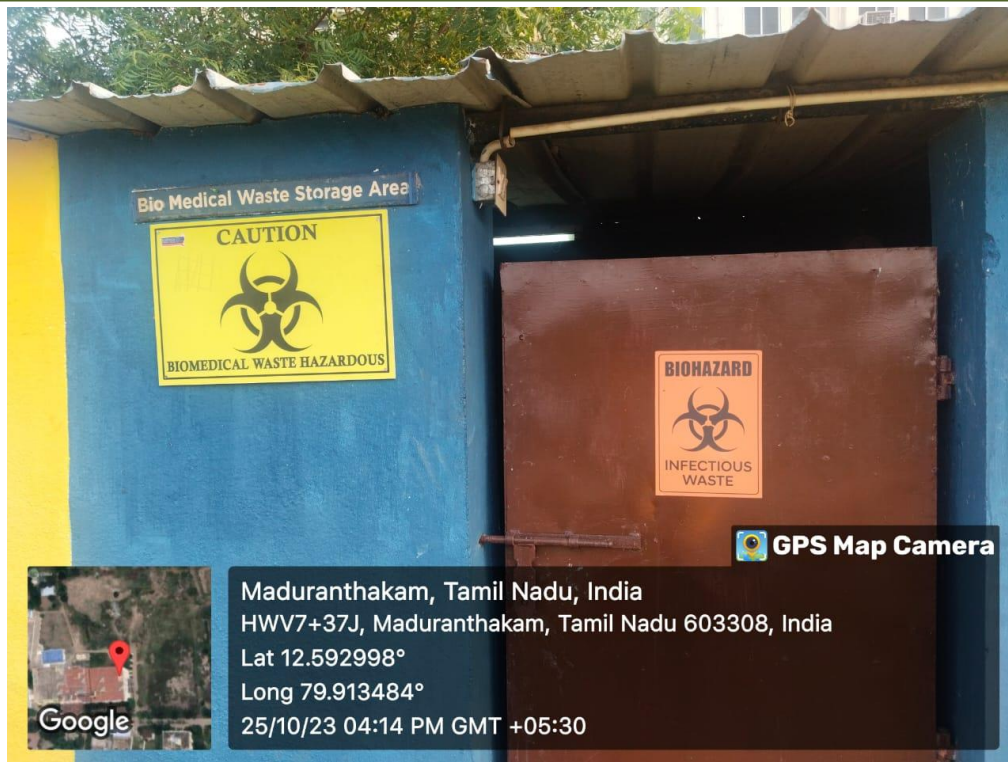
Final collection place from where waste is uploaded in the biomedical vehicle.