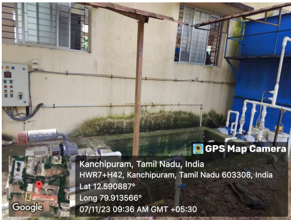
Effluent treatment plant