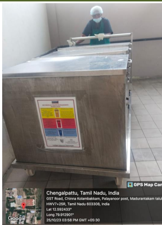
Transport of waste