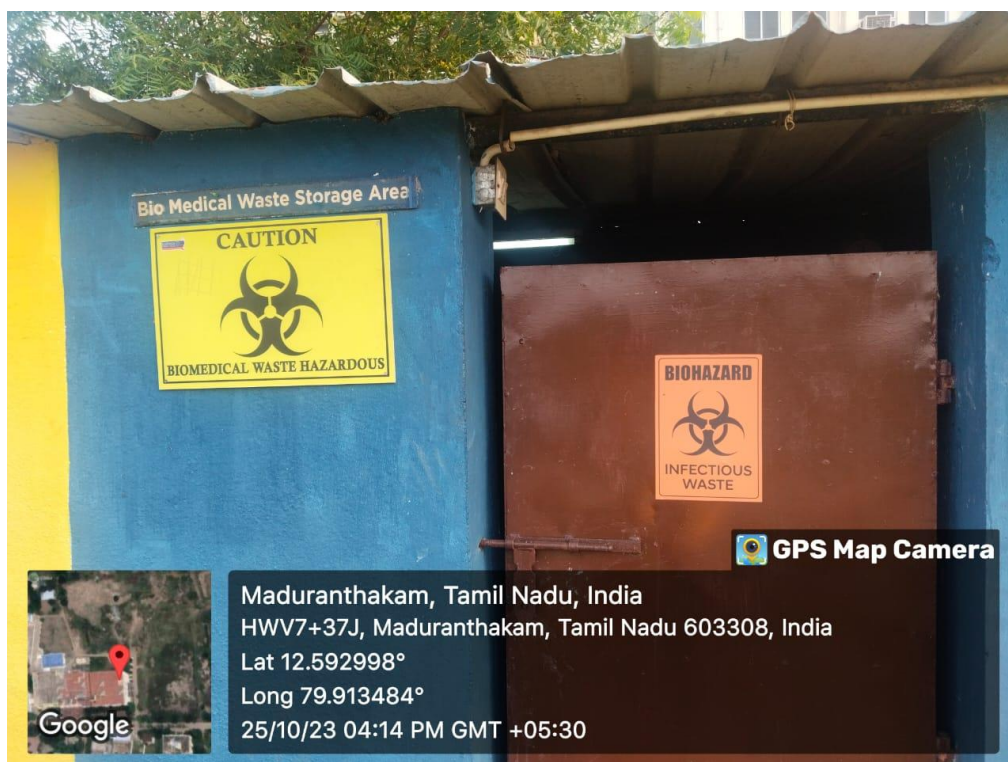
Final collection of biomedical waste and ready for transport