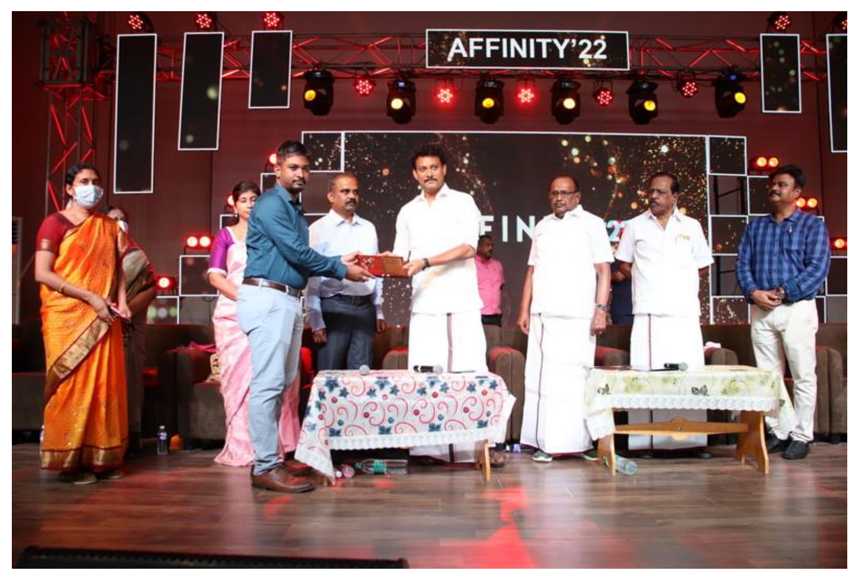
Page 11 of 12