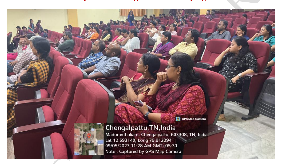
Teachers ready to play Musical chair