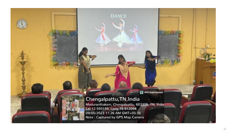
Faculty and students gathered for the program

Ph.no: 044-27598484/27565195; Fax: 044-27565170; E-mail:kims.medical@yahoo.com; Website: www.kveg.in