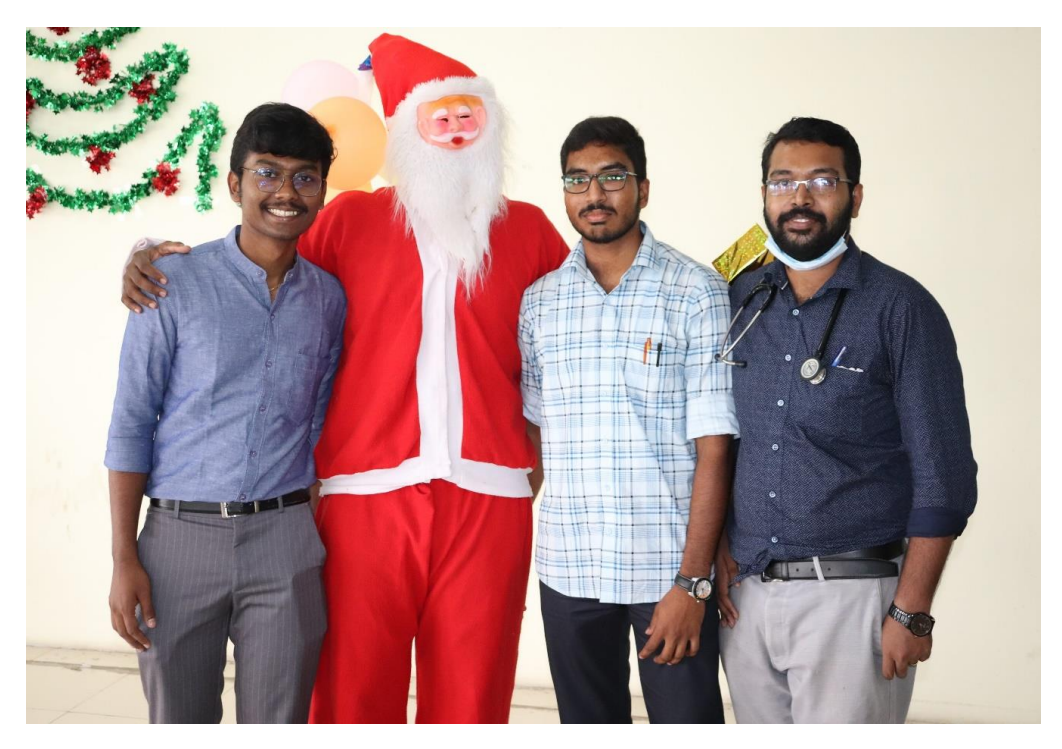
Page 5 of 6