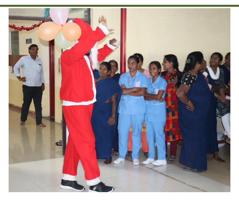
Faculty members, administrators and students enjoying the fun moments

Ph.no: 044-27598484/27565195; Fax: 044-27565170; E-mail:kims.medical@yahoo.com; principaloffice@kims.edu.in, Website: www.kims.edu.in