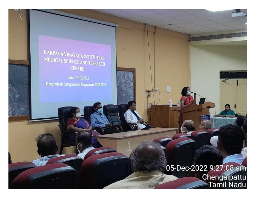
Page 1 of 5