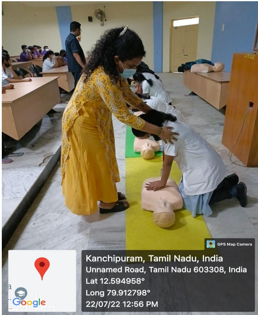
Hands on session