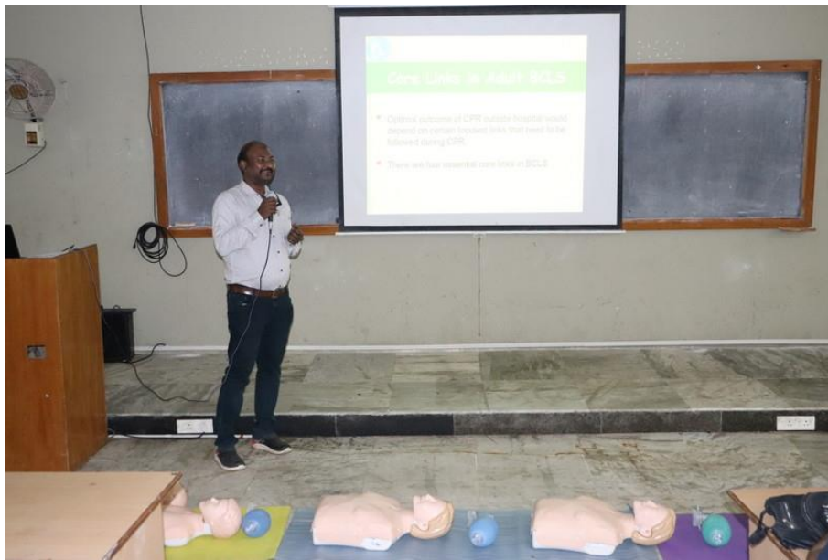
Session on Cardiopulmonary Resuscitation

Every year 16 th October, WORLD RESTART A HEART DAY is celebrated. This year, we trained Students of Karpaga Vinayaga Engineering College about CPR.