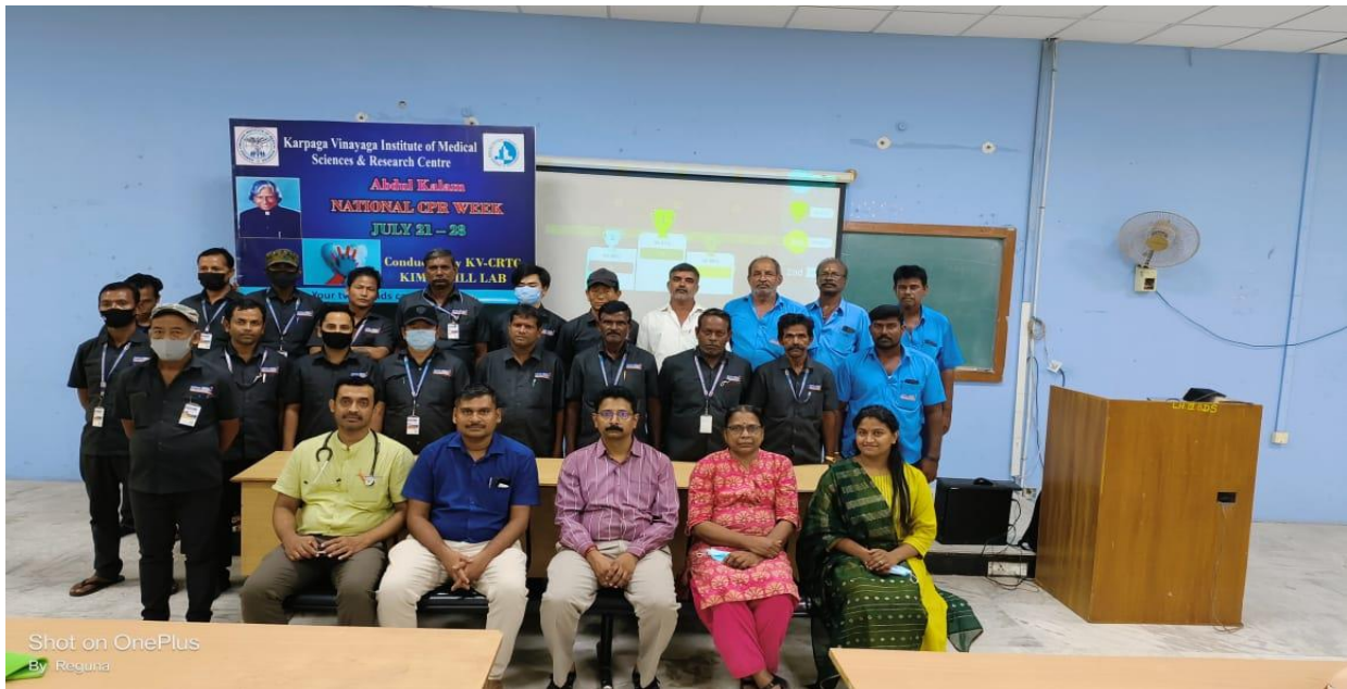
Group photo: Skill lab team with Participants (Security guards and drivers)