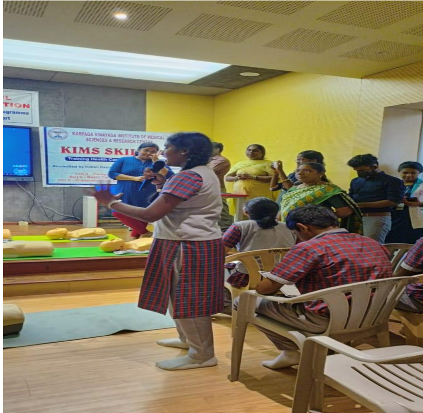
Review about the program by Prasan Vidya Madir School student