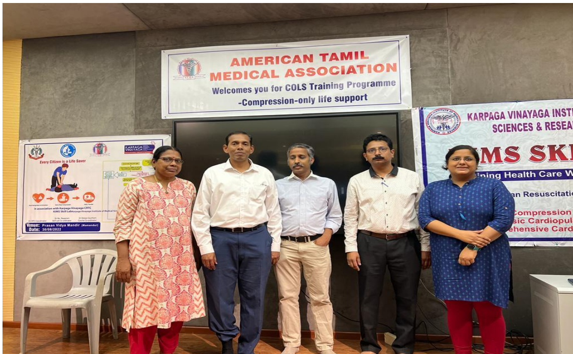
SKILL LAB TEAM AND AMERICAN TAMIL MEDICAL ASSOCIATION TEAM

Skill Lab, Karpaga Vinayaga Institute of Medical Sciences and Research Centre in association with American Tamil Medical Association organized workshop on Compression only Life Support at Tanjavur Govt. Medical College.