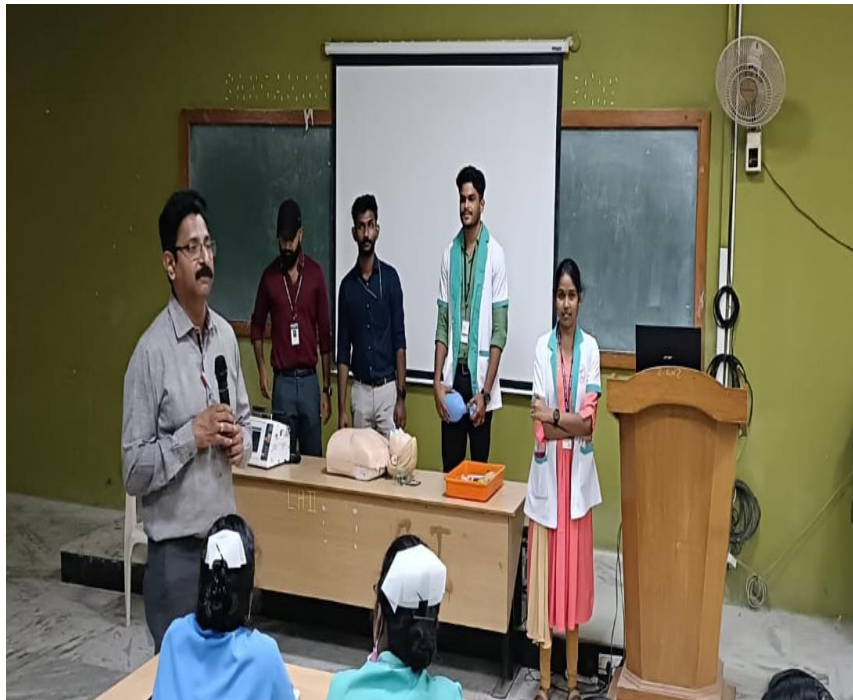
Lecture and Practice for OT AT Interns