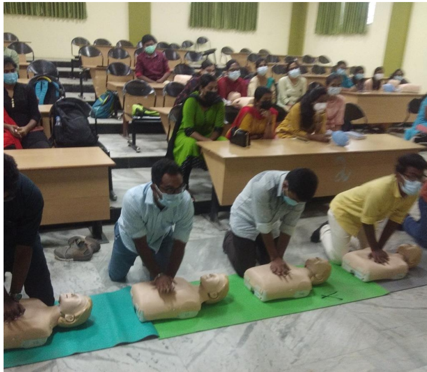
Hands on Practice OT AT Interns