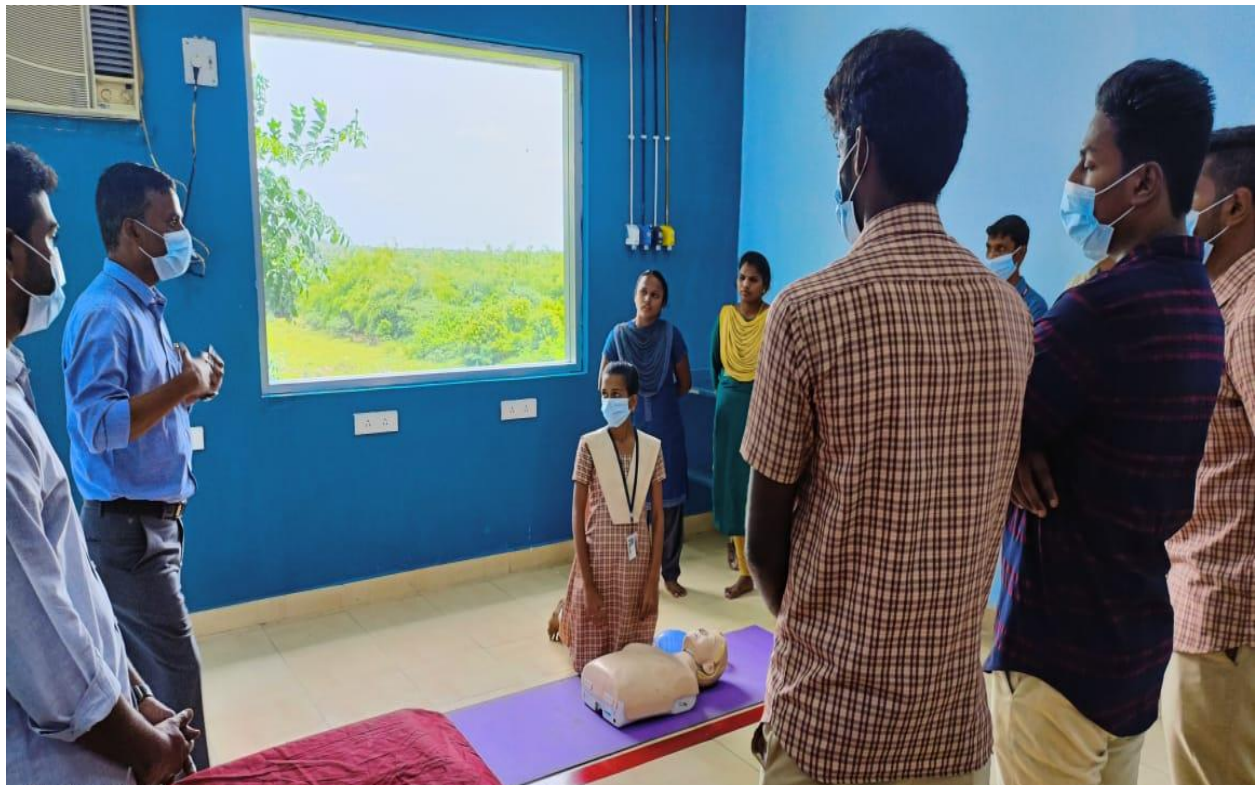
Hands on practice for students of Melmaruvathur Adhiparasakthi Institute of Medical Sciences and Research

Participants were evaluated by pre and post-test.