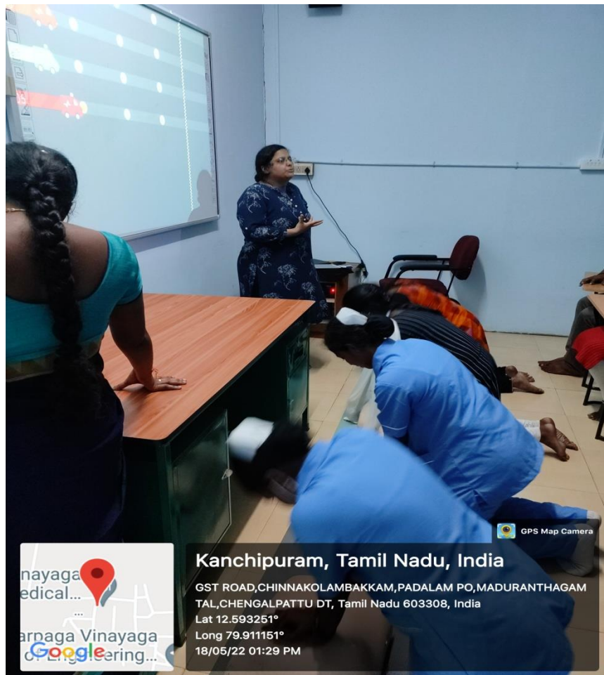
Hands on practice for Staff Nurses