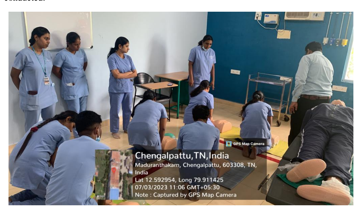
Hands on practice for Dental PGs

Hands on Practice covered by all Instructors. At the end of the workshop pre and post-test was conducted.