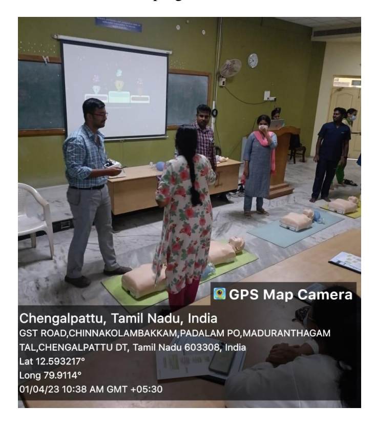
Hands on practice

All the participants actively participated in hands on session. Feedback on workshop was obtained and post-test was conducted for program evaluation.