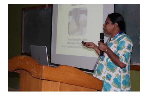
Session on Airway & breathing Page 11 of 14

Participants were evaluated using pre and post-test MCQs. Certificates were awarded to all the participants who successfully completed the course.