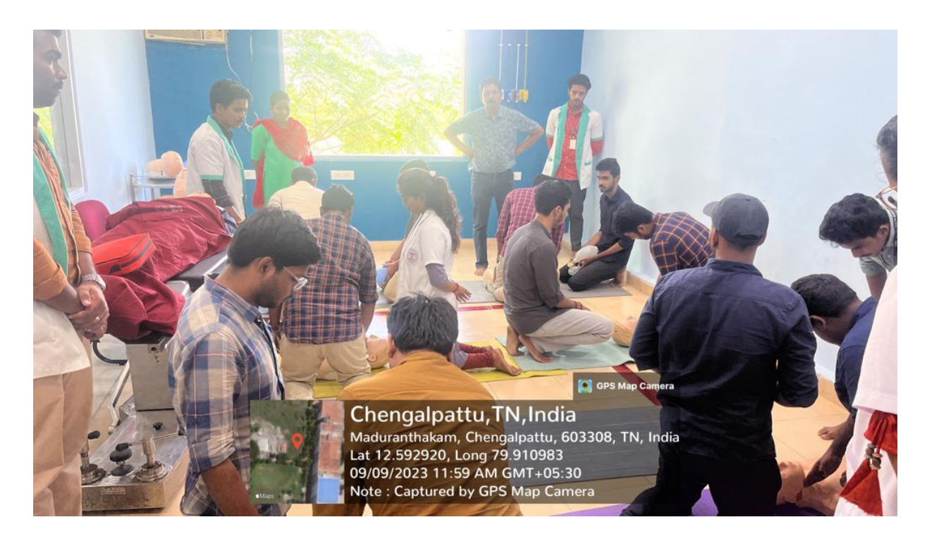
Hands on practice